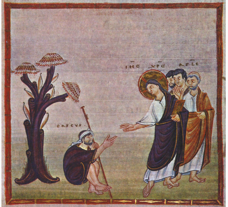
Healing the Blind Man of Jericho by Unknown Author

For example, it is because of her faith that the woman with the hemorrhage is healed. When faith is absent, Jesus is unable to heal; we see this after his rejection in Nazareth.