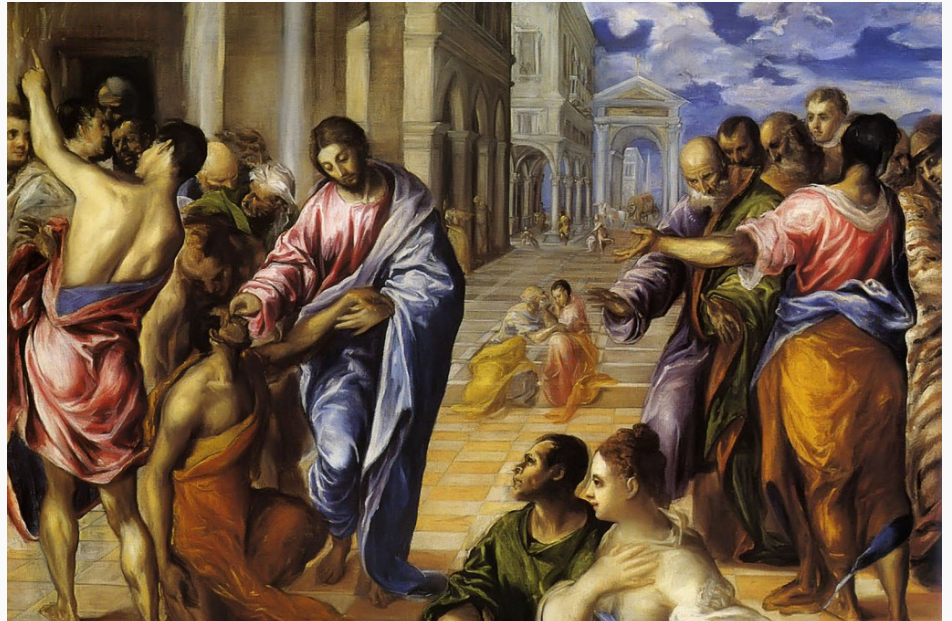
Christ Healing the Blind Man," El Greco, 1560, Venice Oil on canvas, Housed in the Palazzo della Pilotta in Parma, Italy

Today we continue to hear the Gospel of Mark proclaimed. In today's reading, Jesus heals a man who was deaf and had a speech impediment. This is a story about Jesus' healing power, and in it we find clues about our understanding of sacrament. We are struck by the physical means used to heal the man, the use of spittle and touch. The Church continues to celebrate the sacraments using physical means. In the Sacrament of Baptism, water and oil are used to show the power of the Holy Spirit. In the Sacrament of the Anointing of the Sick, we are anointed with holy oil on the forehead and the hands. In the Eucharist, bread and wine become the Body and Blood of Christ. We are a sacramental people who believe that God's grace is given to us through these physical signs.