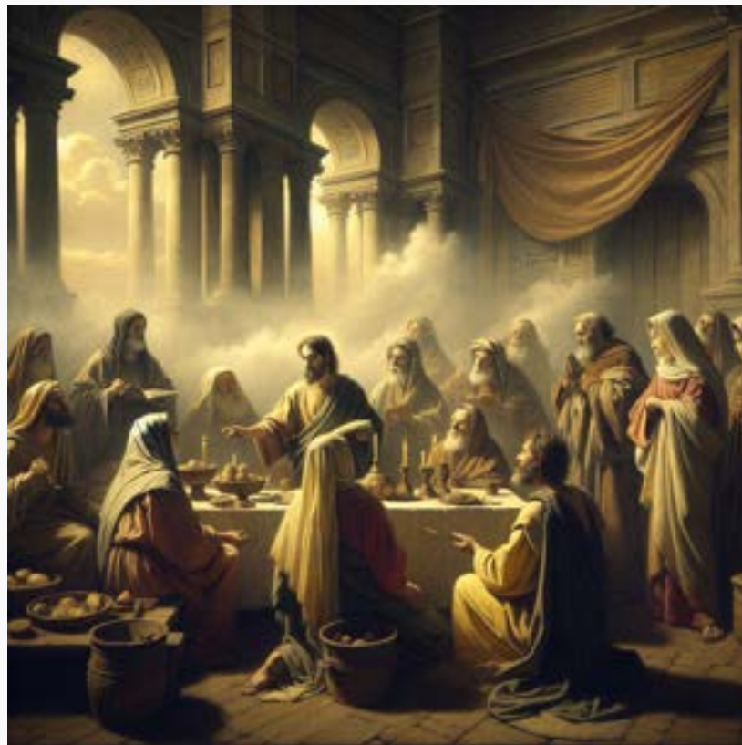
Mark-9-38, Renaissance style digital art. https://bible.art

Today the demon possession described in the Gospels might be seen as a form of mental illness, but the need for healing these syndromes was as real then as it is now. Exorcism was a common practice in first-century Palestine. Some people had the power to heal the symptoms of possession. One of the strategies used was to invoke the name of a person or figure who was believed to have the power to heal.