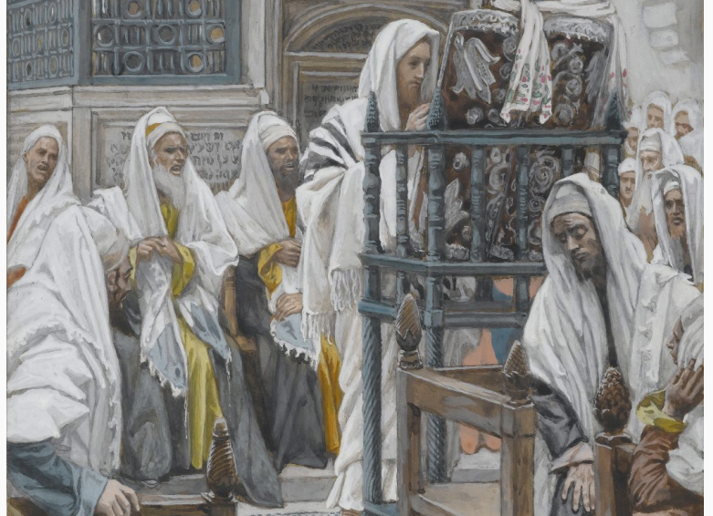
James Tissot (1836-1902), "Jesus Unrolls the Scroll in the Synagogue"

In this Gospel, we learn some interesting details about Jesus and his early life. Jesus' kinfolk know him to be a carpenter, an artisan who works in wood, stone, and metal. He probably learned this trade from his father. Family members of Jesus are also named. Mark describes Jesus as the son of Mary, which is an unusual designation. Adult males were more typically identified with the name of their fathers. It is unclear why Mark deviates from this custom.