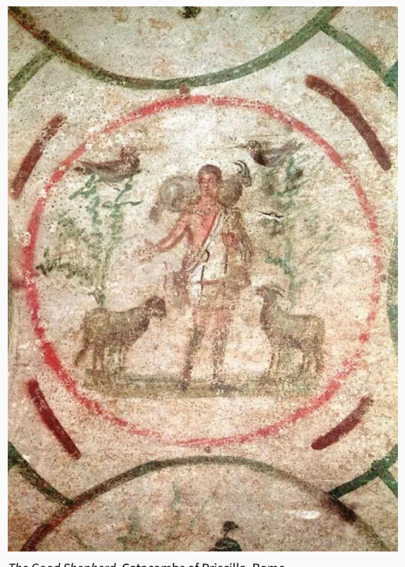
The Good Shepherd, Catacombs of Priscilla, Rome Circa 200 AD, Fresco painting

In the portion of the chapter that we hear proclaimed today, Jesus describes his relationship with his followers as similar to the relationship between a good shepherd and his sheep. As a good shepherd will risk and lay down his life in order to protect his sheep, Jesus willingly sacrifices himself for the sake of his sheep. Jesus contrasts the actions of the good shepherd with the actions of the hired shepherd who abandons the sheep in the face of danger. In the verses following Jesus' teaching, we learn that the Pharisees and the other religious leaders understand that Jesus is referring to them when he describes the hired shepherds.