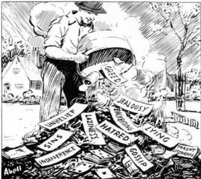
Get Rid of the Old Rubbish