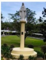
2541 Beechmont Rd, Witheren QLD 4275

All are warmly welcome to Marian Valley. Transportation will be provided at no cost.