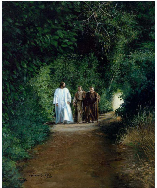
The Road to Emmaus

Painting by Liz Lemon Swindle (born 1953) Painted in 2018, Oil on canvas