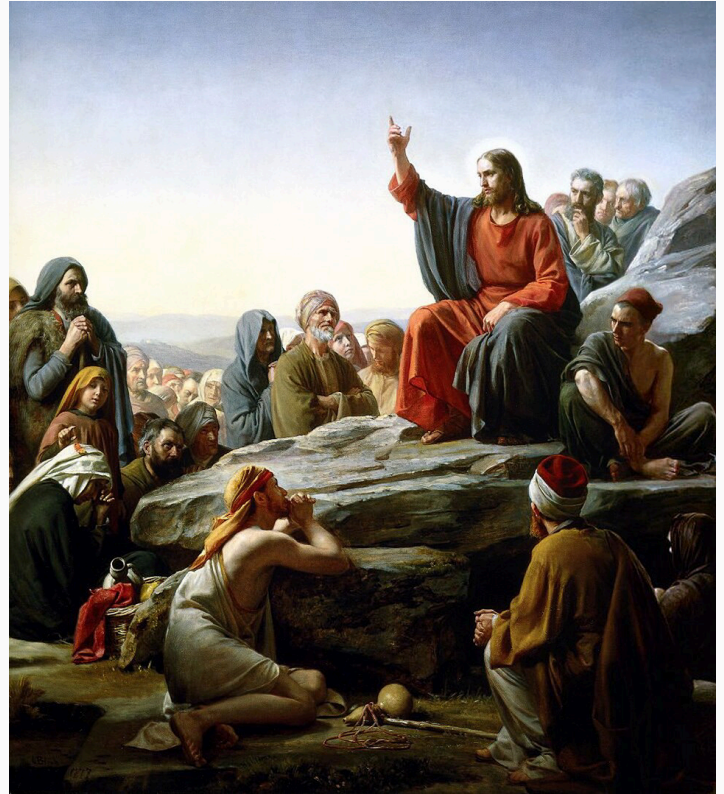
"Sermon on the Mount" by Carl Bloch, 1877

oil on copper, Museum of National History at Frederiksborg Castle Current location: Dansk: Bedestolen See art reflection here: https://tinyurl.com/yc85hd8h