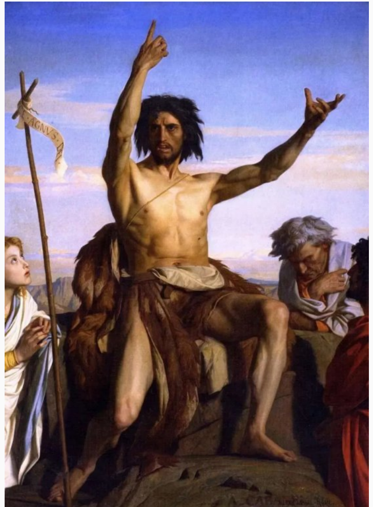
John the Baptist

Painted by Alexandre Cabanel (1823-1889) Painted in 1849, Oil on canvas, © Musée Fabre, Montpellier, France See art reflection here: https://tinyurl.com/tzsfvd9y