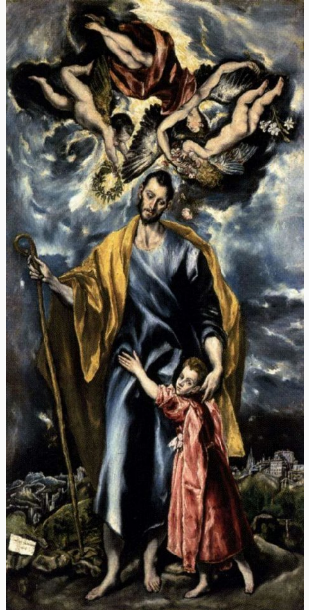
St. Joseph and the Christ Child

Joseph does as the angel of the Lord directs. He takes Mary to be his wife and accepts the child in her womb as his own. Joseph and Mary are both cooperative with God's plan. They are both models for us of what it means to be faithful servants of God.