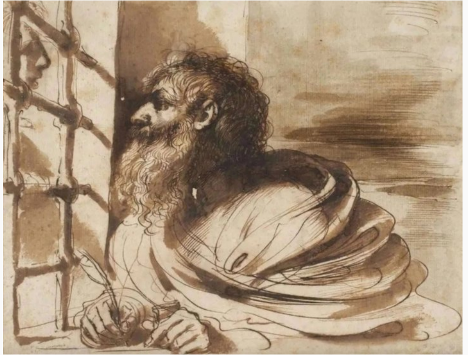
St. John the Baptist in Prison, Visited by Salomé,

This week's Gospel Reading continues our Advent reflection on the person and message of John the Baptist. Last week we heard John speak about his relationship to the coming Messiah, Jesus. This week, we hear Jesus' message to John the Baptist, now in prison, about the signs of the kingdom found in Jesus' ministry and Jesus' assessment of John's role in the Kingdom of God.