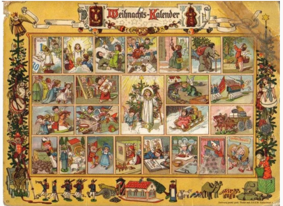
Weihnachts-Kalender, Im Lande des Christkinds,

In this new liturgical year, the Gospel of Matthew will be the primary Gospel proclaimed (Lectionary Cycle A). In today's Gospel, we hear Jesus speak about the need for wakefulness, for watchful waiting, for the coming of the Son of Man.