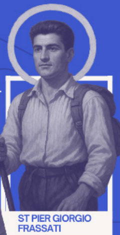
ST PIER GIORGIO FRASSATI