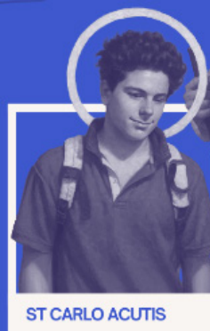
ST CARLO ACUTIS