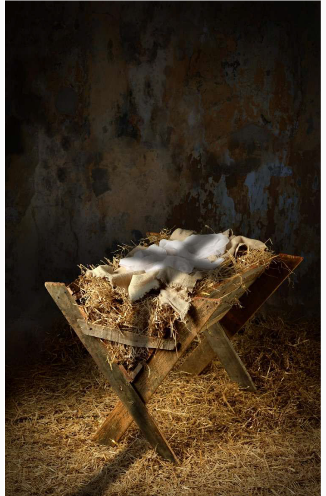
Manger with shadow of cross, Photograph by Gino Santa Maria, Photographed on 23 March 2010, Digital photo © Alamy Stock Photo / Gino's Premium Images/ Alamy Stock Photo See art reflection here: https://tinyurl.com/yr58jt44