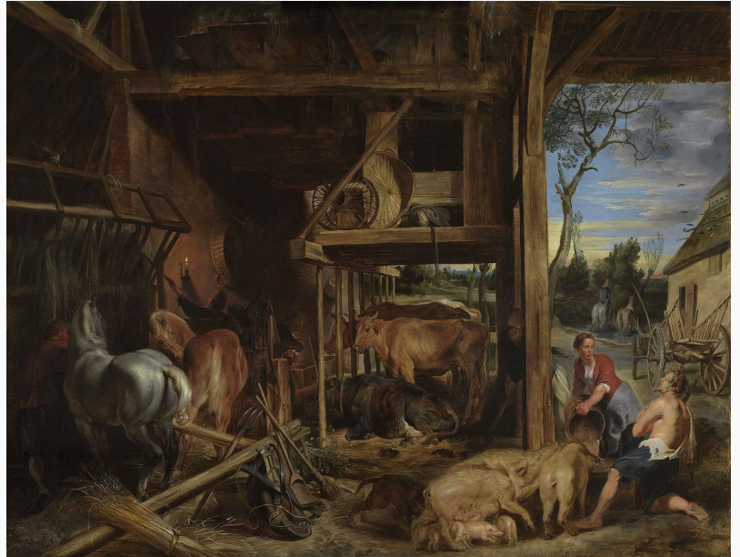
The Prodigal Son, Painting by Peter Paul Rubens (1577-1640),

The Pharisees taught a scrupulous observance of Jewish Law. In their interpretation and practice, observant Jews who shared table fellowship with sinners would be made unclean. Like Jesus, the Pharisees hoped to lead sinners back to God. The Pharisees, however, required that sinners first become ritually clean—observant of the Pharisees' interpretation of Jewish Law—before sharing table fellowship. This appears to be one of the major differences between the Pharisees and Jesus. Jesus reaches out to sinners while they are still sinners, inviting them to conversion through fellowship with him. Jesus is God acting among us; by befriending us, he is inviting us to return to friendship with God. Through friendship with Jesus, our sins are forgiven and we, in turn, bear fruit for God. Recall last Sunday's Gospel and the barren fig tree.