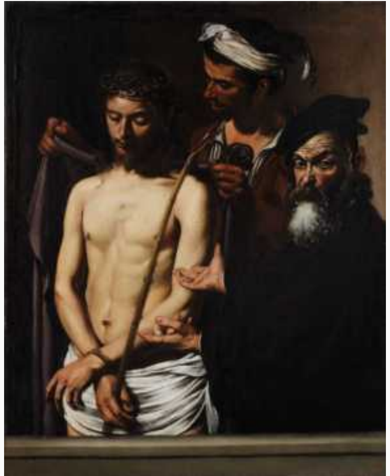
Ecce Homo, Painting by Caravaggio, Michelangelo Merisi da Caravaggio (1571-1610) Painted circa 1605, Oil on canvas @ Musei di Strada Nuova, Genoa, Italy See reflection here: https://tinyurl.com/4w9h7c2e