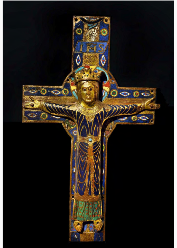
Christ the King Crucified, Executed in Limoges between 1200-1215, Enamels on copper, Reflection on the enamelled cross https://tinyurl.com/5hyjxk4t